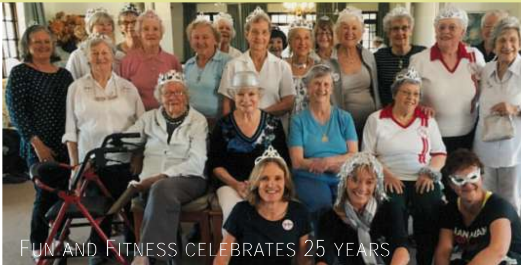
FUN AND FITNESS CELEBRATES 25 YEARS

On Heritage day, the SASFA (South African Senior Fitness Association) also known as the Fun and Fitness ladies, celebrated their 25th Anniversary at Formosa Garden Village.