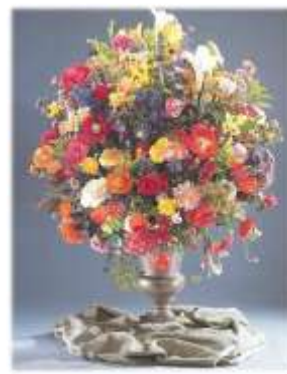
Old World Beauty